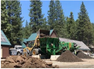
Rock Crushing-Used Native for Backfill (Green Footprint)

Project included historic rock wall preservation.