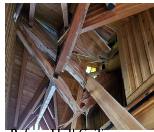
Before Hall Ceiling