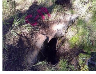
C-19 Culvert Before