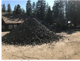
Recycled Native to Reduce Import (Green Footprint)